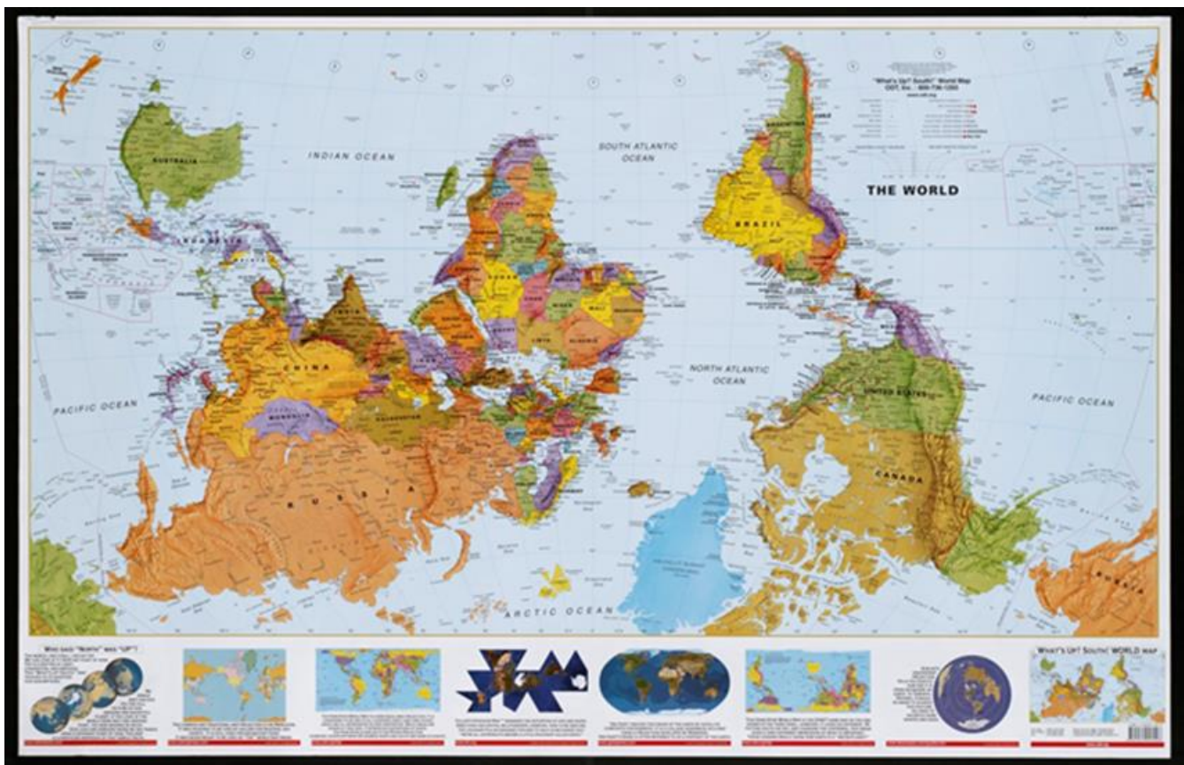
ODT, Inc. "What's up? South!" Map. Amherst, Mass: ODT, [ca. 2002]. Norman B. Leventhal Map & Education Center